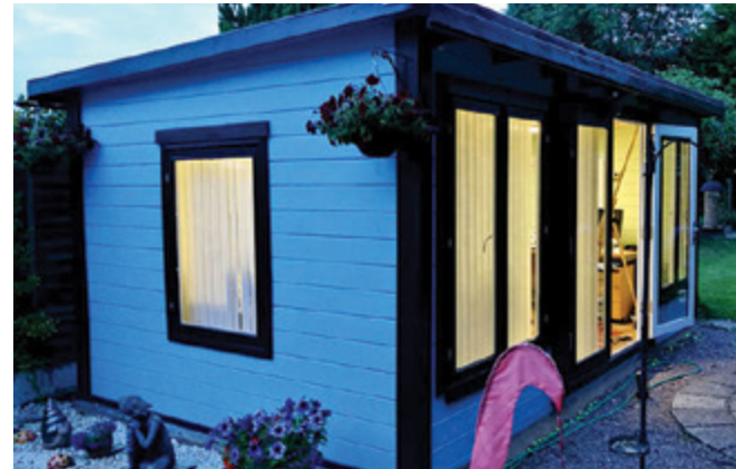
The MAGIC STUDIO! Where all our creations come to life!

Having worked on designs for well known brands such as BMW, Cadbury, Marks & Spencer and the BBC, he and his team know how critical it is to have a keen eye for detail together with creative flair and fantastic communication skills.